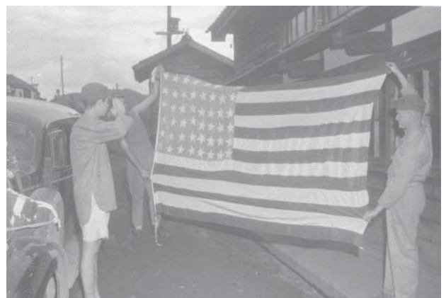
The Stars& Stripes made with parachute cloth soon after the war