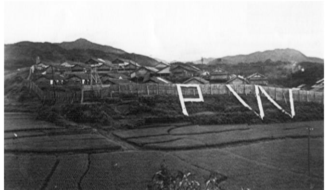
Miyata Camp soon after the war